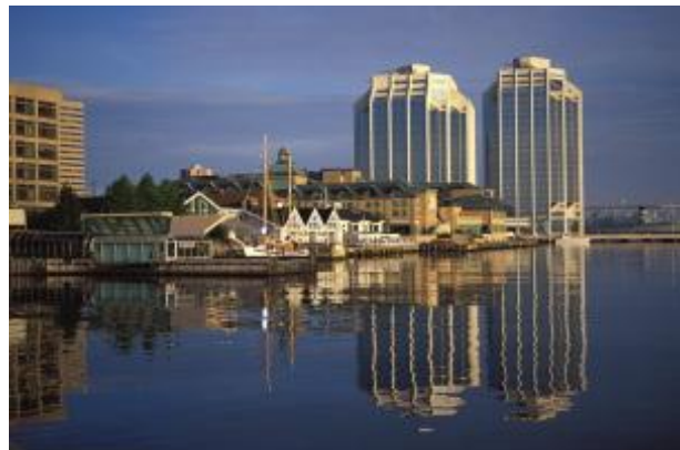
Halifax Harbour